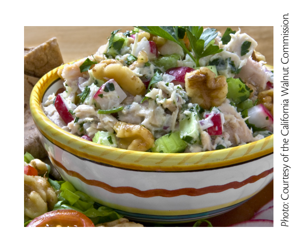
Smart tuna salad.

Almonds, pecans, pistachios, and walnuts have high levels of unsaturated fatty acids. Extensive research on diet and health indicates that including these nuts in a diet low in saturated fat and cholesterol may protect against heart disease.