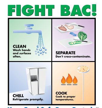
Keep Food Safe From Bacteria

All consumers need to follow the Four Basic Steps to Food Safety: Clean, Separate, Cook, and Chill.