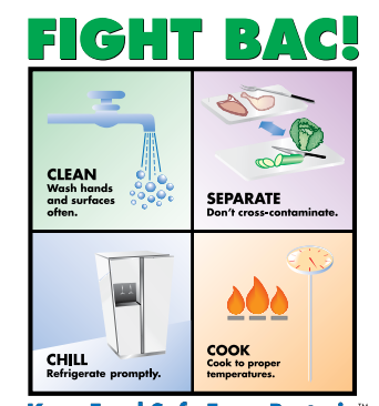
Keep Food Safe From Bacteria

All consumers need to follow the Four Basic Steps to Food Safety: Clean, Separate, Cook, and Chill.